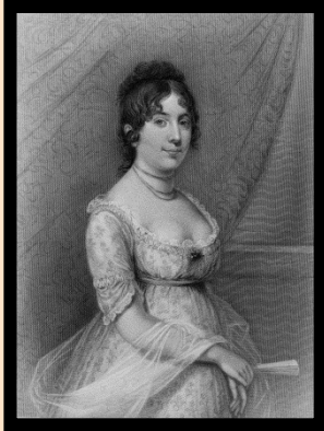
Portrait of Dolley Madison