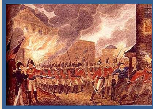
British Burning the White House, War of 1812